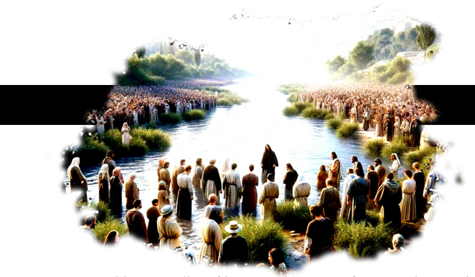
<u>Friday</u> - Add to your list of lost people to pray for. Spend some time imagining how you might talk to them about Jesus or invite them into the reign of Christ.

<u>Saturday</u> - What are five habits you have gained from this month that you plan to continue moving forward?